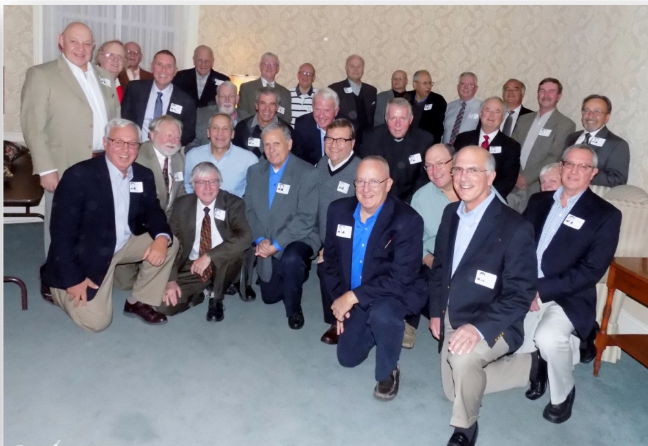
1965 50th Reunion in 2015.