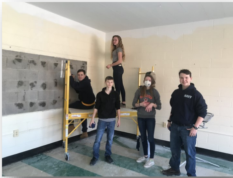
NJROTC Cadets preparing room

Classroom updates were provided by a local contractor, as well as additional assistance from the NJROTC cadets. Special thanks to all the students, parent volunteers, and especially donors that made this possible!