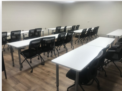
Room mostly complete. Technology to be delivered in February