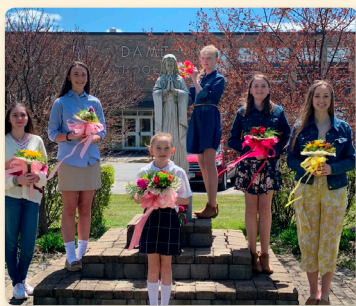
Students bring flowers and crown the statue of the Blessed Virgin Mary for the virtual May Crowning.